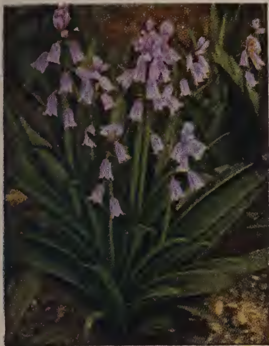
Scilla campanulata, Blue